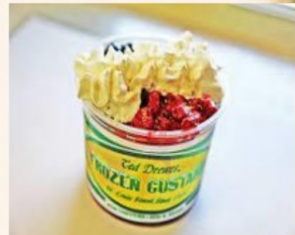
Ted Drewes Frozen Custard and Toppings *

Video presentations by Eastern Area of Missouri Archives at 1:30 pm and 3:00 pm