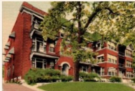
Gibson Hotel – St. Louis